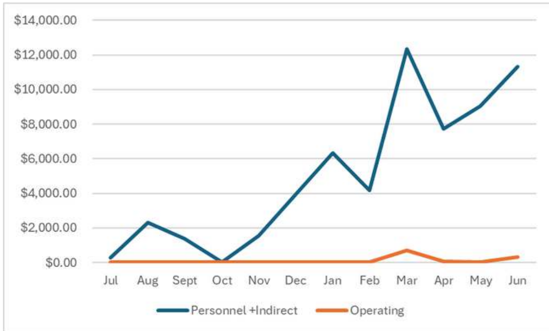
FY 2023 Operating Expenditures by Month