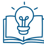
Idaho State University