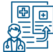
MOUD Clinic Services