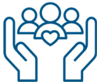
Genesis Community Health