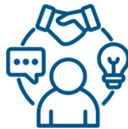
Drug Overdose Prevention Program