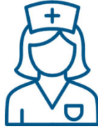
Nurse Family Partnership