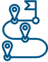
Five-Year Strategic Plan