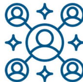
Trivium Life Services