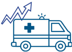
Community Health EMS