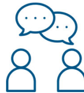
Trauma Intervention Program of Treasure Valley